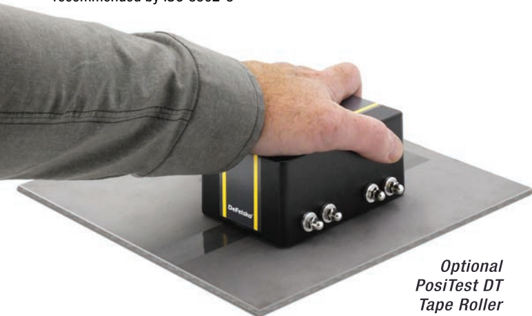
Optional PosiTest DT Tape Roller

Conforms to ISO 8502-3, AS 3894.6, US Navy PPI 63101-000